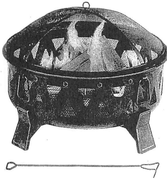
RECREATIONAL BURNING DEVICE